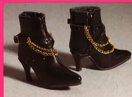
Alcatraz in Gold #014-102 $22.00