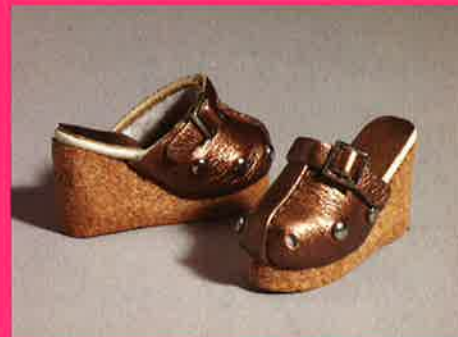
Golden Gaits #014-104 $22.00