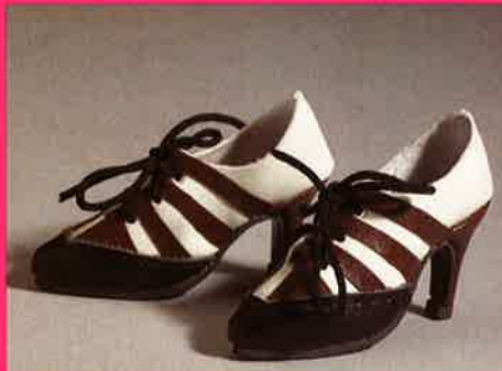
City Lace-ups #014-106 $22.00