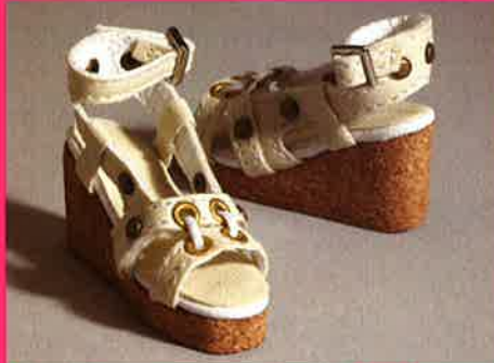
Cable Car Wedges #014-108 $22.00