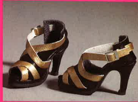
Sightseers #014-10 $22.00