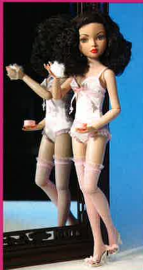
ESSENTIAL ELLOWYNE BRUNETTE #010-103 $69.00