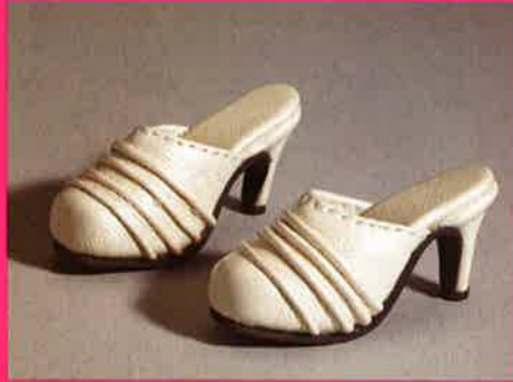
North Beach Mules #014-105 $22.00