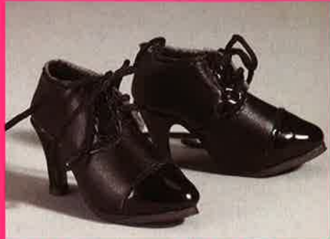
Embarcaderos #014-103 $22.00