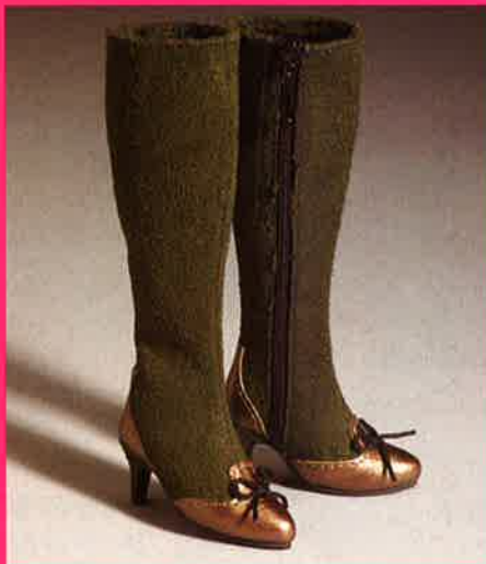
Pacific Heights #014-101 $26.00