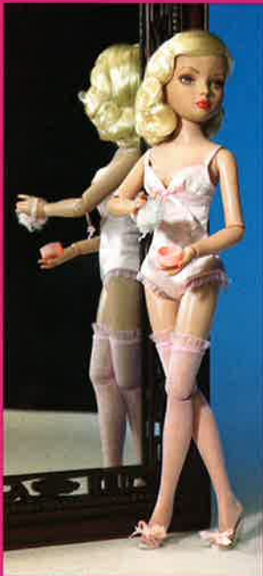
ESSENTIAL ELLOWYNE BLONDE #010-102 $69.00

Each Essential Ellowyne doll comes dressed in a pink satin teddy, complete with pink sheer stockings, delicate slip-ons, and a powder puff accessory, for those essential touch-ups. Designer stand included.