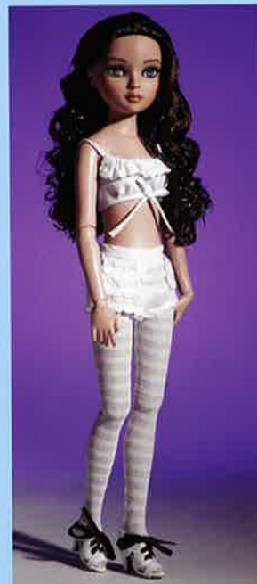
ESSENTIAL ELLOWYNE, TOO BRUNETTE #010-107 $74.00