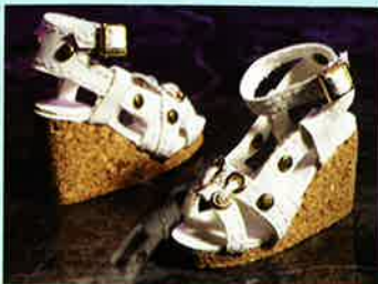
Cable Car Wedges #014-108 $22.00