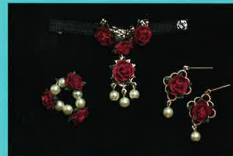
Fire & Ice Jewelry Set W15-103 $39.00