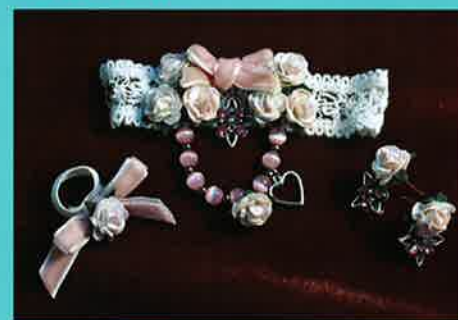
Ribbons and Roses Jewelry Set W15-101 $39.00