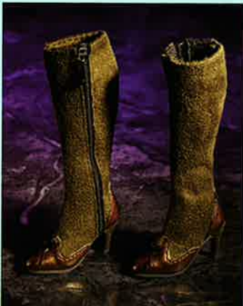
Pacific Heights #014-101 $26.00