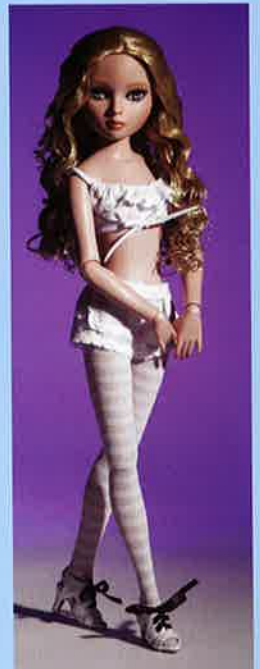
ESSENTIAL ELLOWYNE, TOO BLONDE #010-106 $74.00