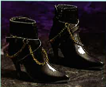
Alcaraz in Gold #014-102 $22.00