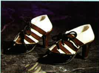
City Lace-ups #014-106 $22.00