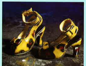
Very Vintage #014-112 $22.00