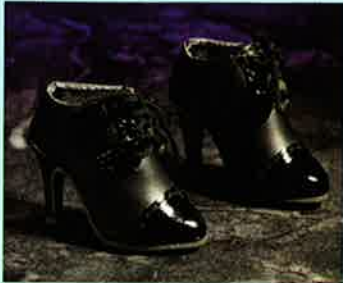
Embarcarderos #014-103 $22.00