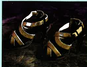
Sightseers #014-107 $22.00