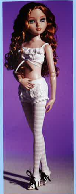
ESSENTIAL ELLOWYNE, TOO REDHEAD #010-108 $74.00

Each Essential Ellowynne, Too comes dressed in a designer two piece set, striped stockings, and lace-up shoes. New designer saddle stand also included.