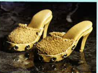
70's Chic #014-111 $22.00