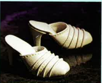
North Beach Mules #014-105 $22.00