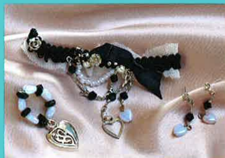
Arsenic & Lace Jewelry Set W15-102 $39.00

Designer Jewelry created especially for Ellowyne, Prudence, and Evangeline Ghastly!