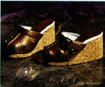
Golden Gaits #014-104 $22.00