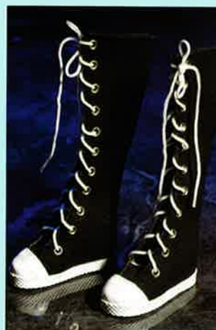
Retro Runners #014-110 $24.00

CALL TOLL FREE TO ORDER 1-866-90-WILDE M-F 8:30 a.m. to 5:30 p.m. EST Shop 24/7 at www.ellowynewilde.com