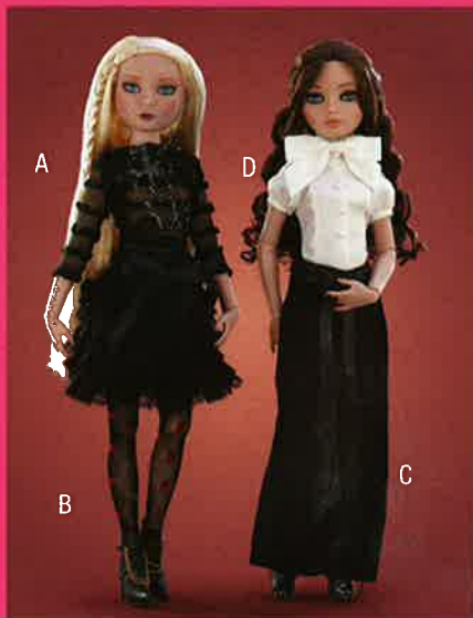
A. Woeful Black Ribbed Top $22 016-119 B. Woeful Ruffled Tiered Skirt $25 016-109 C. Woeful Black Pants $25 016-121 D. Woeful Bow Blouse $22 016-106