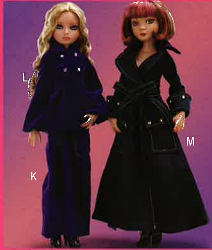
K. Woeful Purple Pants $24 016-120 L. Woeful Jacket $46 016-122 M. Woeful Coat $46 016-101