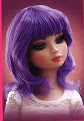
DREAMS 014-116 $25