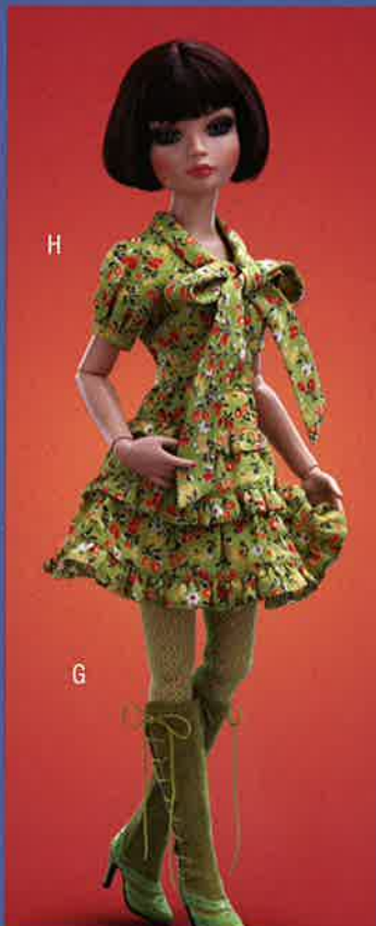
G. Ennui Green Ruffled Skirt $28 016-134 H. Ennui Green Print Blouse $24 016-135