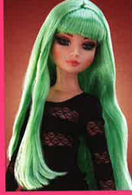
JADED 014-123 $25