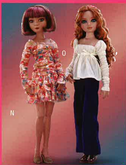
N. Woeful Coral Dress $32 016-104 O. Woeful Gathered Top $24 016-108