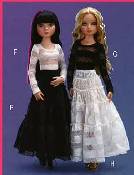
E. Woeful Black Tiered Skirt $32 016-115 F. Woeful White Stretch Lace Top $22 016-118 G. Woeful Black Stretch Lace Top $22 016-117 H. Woeful White Tiered Skirt $32 016-114