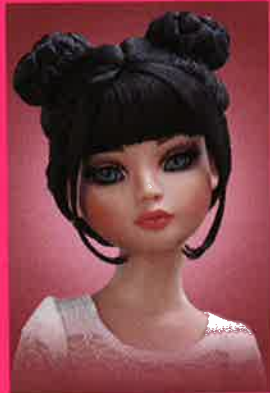
BORED 014-121 $25