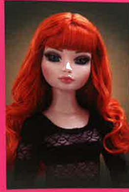
WISHES 014-117 $25

THE COMPLETE MELANCHOLY COLLECTION Consists of all 8 wigs - $170 A savings of $30 #014-125