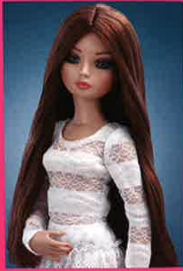
REALITY 014-118 $25