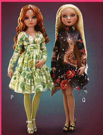
P. Woeful Green Dress $32 016-105 Q. Woeful Black Dress $30 016-110