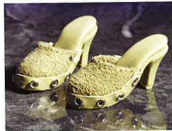
70's Chic #014-111 $22.00