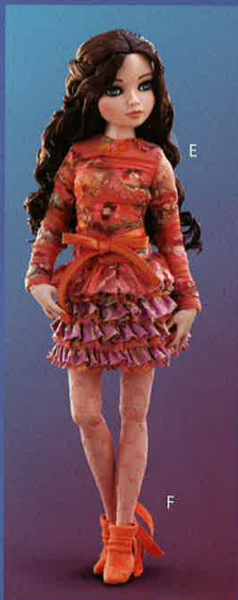
E. Ennui Orange Print Blouse $24 016-127 F. Ennui Pink Ruffled Skirt $28 016-130