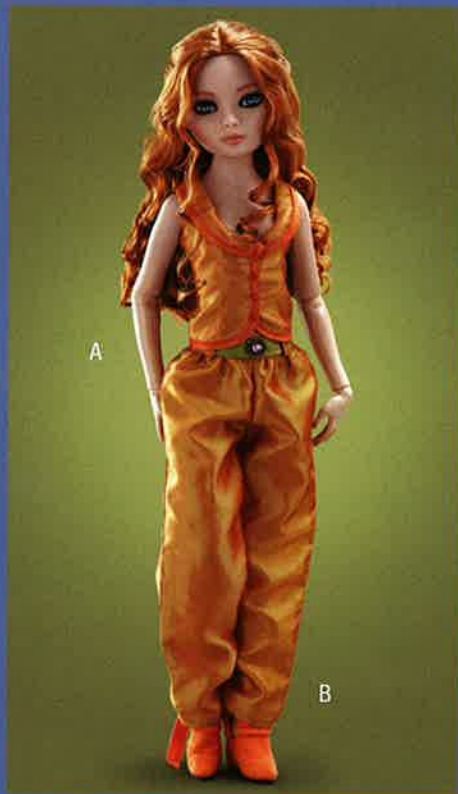
A. Ennui Yellow vest $22 016-128 B. Ennui Yellow Pants $24 016-133

ENNUI THRIFT SHOP COLLECTION 016-138 $252 A SAVINGS of Over $46 Includes all 11 Separates shown !