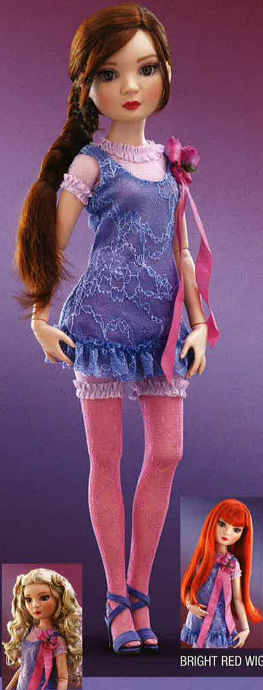
BRIGHT RED WIG