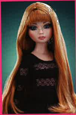
HOPE 014-115 $25

Oh sorry where did I begin? Who am I? I'm just Ellowyne