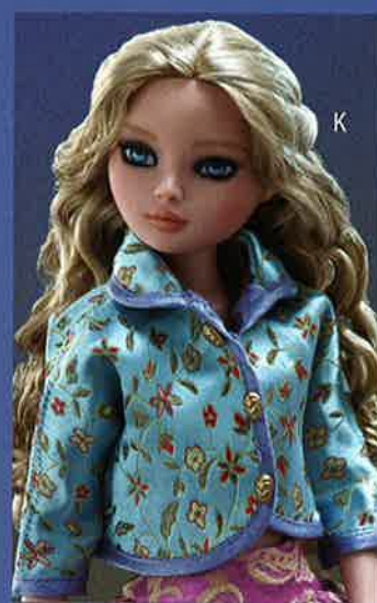
K. Ennui Blue Satin Jacket $38 016-137

CALL TOLL FREE TO ORDER 1-866-90-WILDE M-F 8:30 a.m. to 5:30 p.m. EST Shop 24/7 at www.ellowynewilde.com