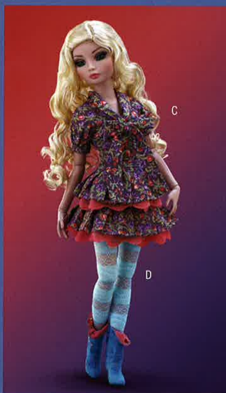
C. Ennui Purple Print Blouse $24 016-129 D. Ennui Purple Ruffled Skirt $28 016-131