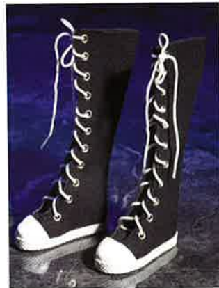
Retro Runners #014-110 $24.00