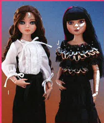
I. Woeful Ruffled Blouse $24 016-107 J. Woeful Ribbon & Dots Top $25 016-116