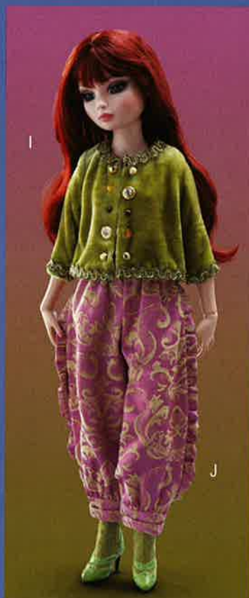
I. Ennui Green Jacket $38 016-136 J. Ennui Pink Pants $24 016-132