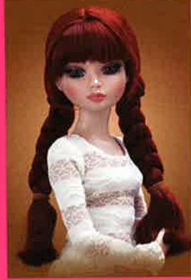
EXPECTATIONS 014-120 $25