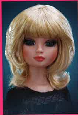
DISSATISFACTION 014-124 $25