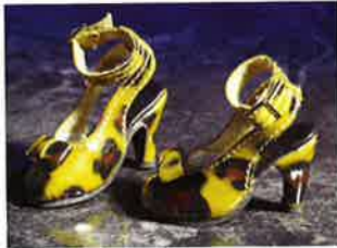
Very Vintage #014-112 $22.00