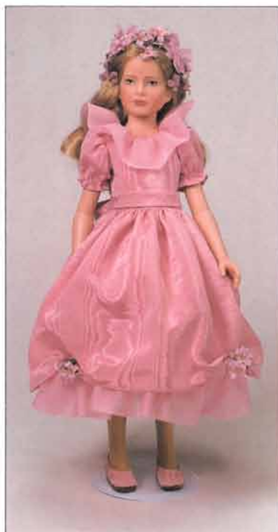
Kaylie Bridesmaid (right)

VINYL 14" TALL LE 500 SUGG. RET. $240.00