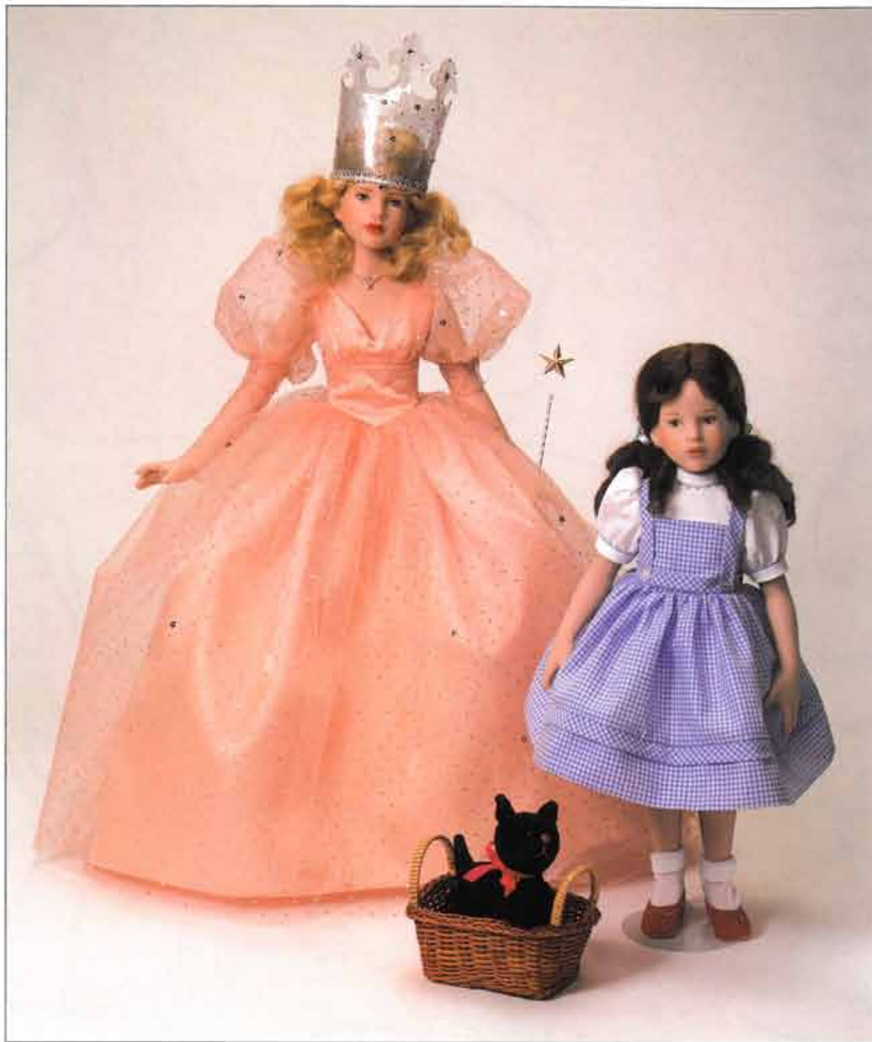
Glinda (left) PORCELAIN 18" TALL LE 150 SUGG. RET. $750.00