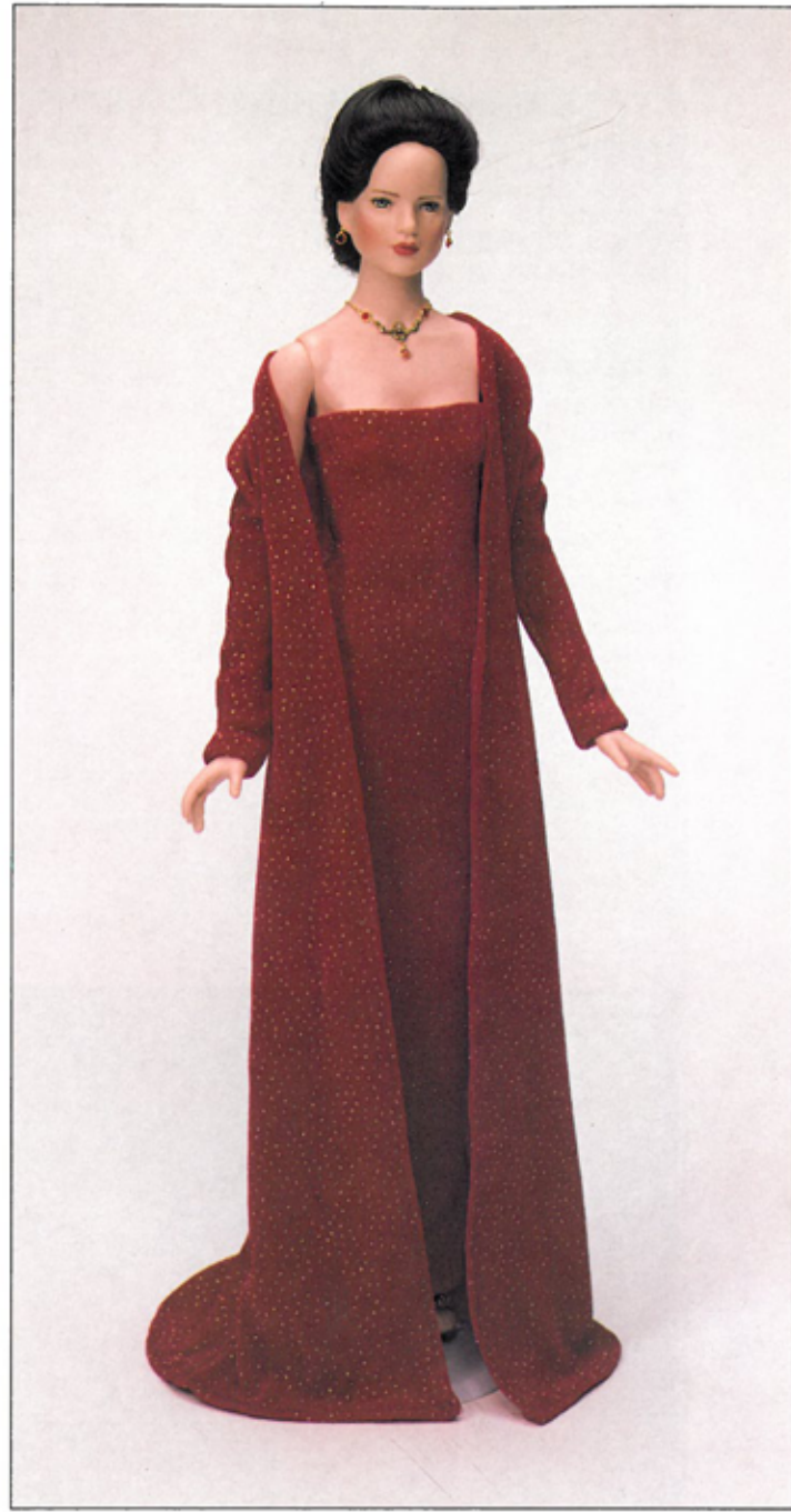
Paige (right) VINYL 20" TALL LE 500 SUGG. RET. $280.00