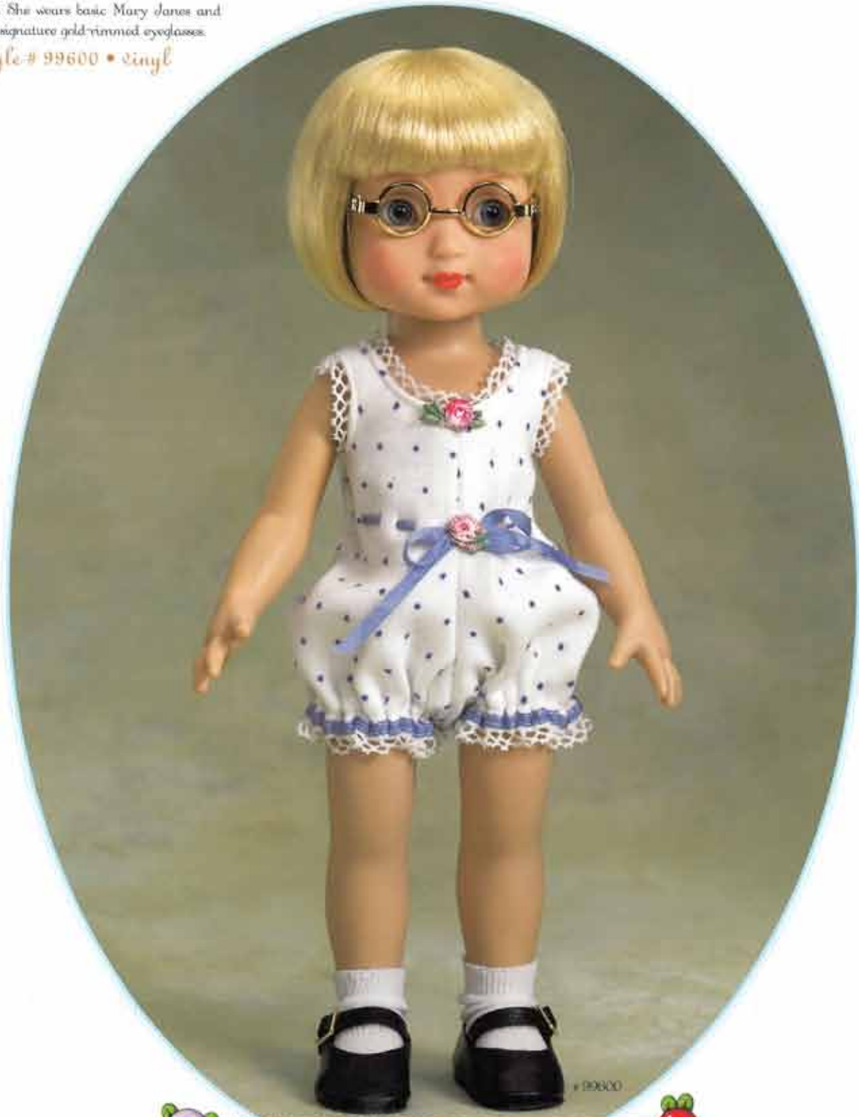
style # 99600 • vinyl

Ann Estelle is just waiting for you to dress her up! The basic doll comes in a blue dotted onesie trimmed in white lace. Pink rosettes accent the neck and waistline. She wears basic Mary Janes and her signature gold-rimmed eyeglasses.