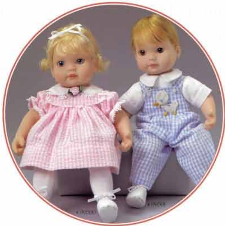
8" Merry McCall style # 99590 • vinyl/soft bodied