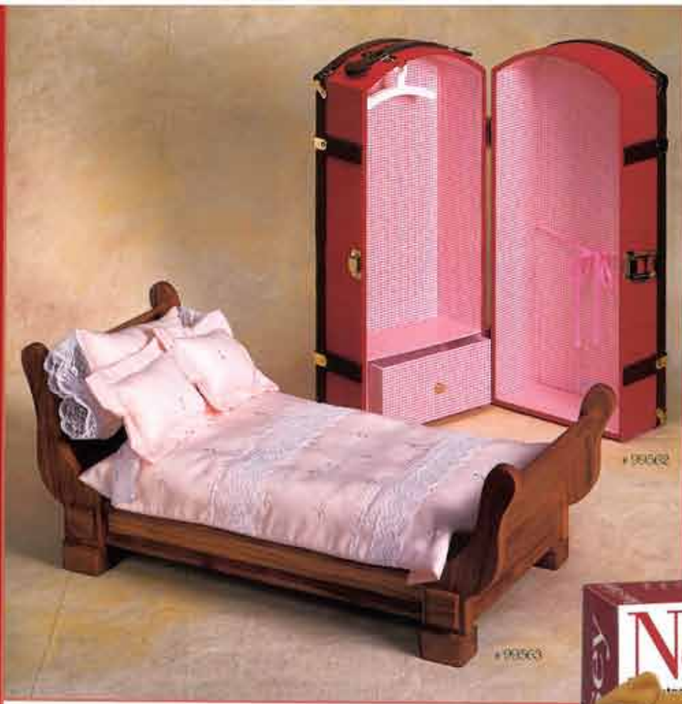
Betsy & Barbara's Bed style # 99563