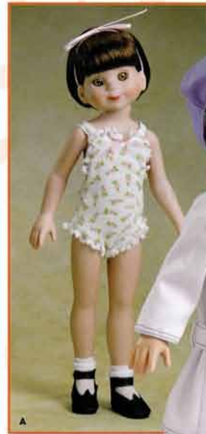
A. Just Betsy BASIC DOLL BM 0301 OPEN $29.99