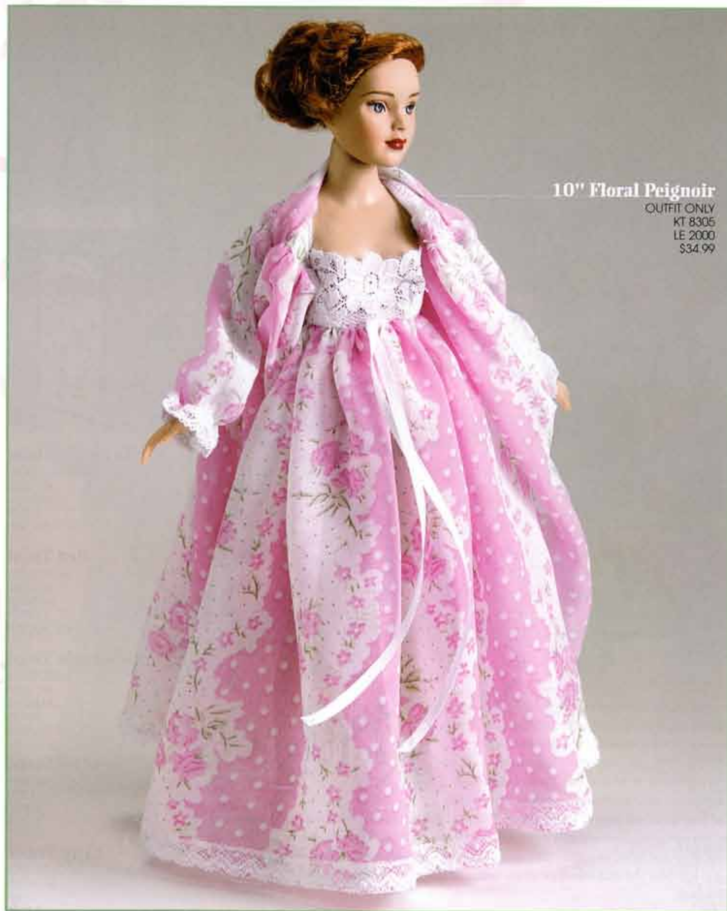
10" Floral Peignoir OUTFIT ONLY KT 8305 LE 2000 $34.99