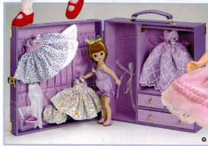
G. Lilacs & Lace Trunk Set TRUNK SET BC 6301 LE 1000 $124.99