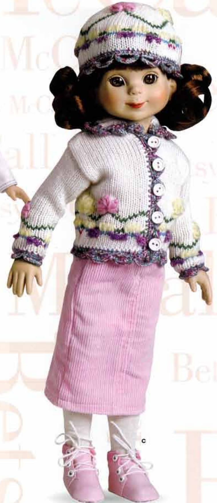
C. Sweater Stylin' DRESSED DOLL BM 1301 ANNUAL $99.99