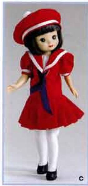
C. Anchors Aweigh OUTFIT ONLY BC 8302 LE 2000 $24.99