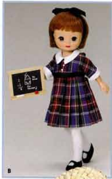
B. Perfect Marks OUTFIT ONLY BC 8305 LE 2000 $24.99