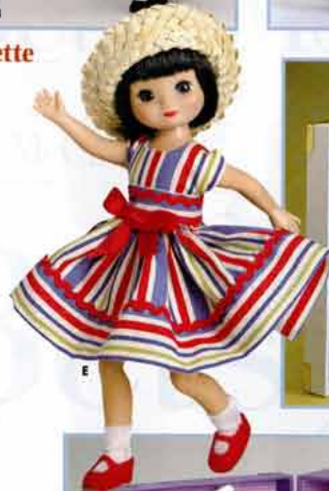
E. Fiesta Fun OUTFIT ONLY BC 8301 LE 2000 $24.99