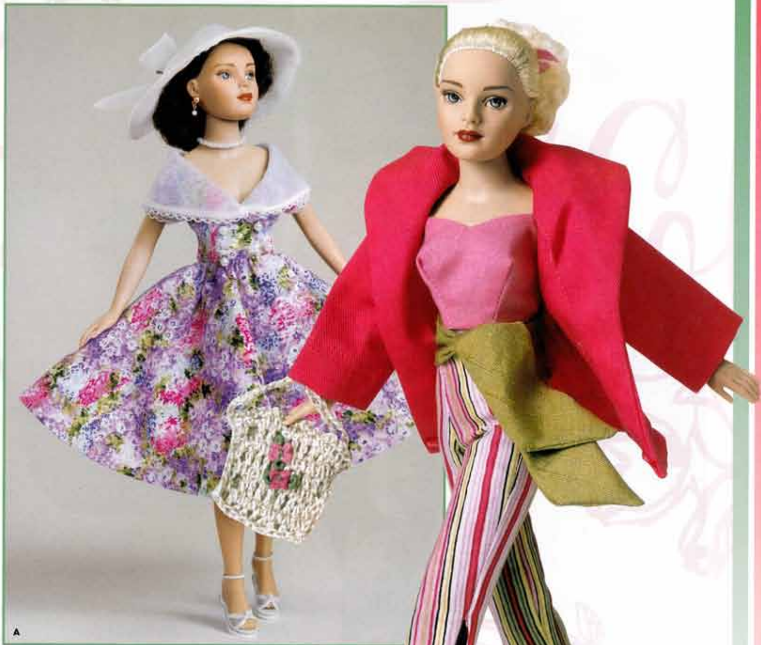
A. 10" Garden Party OUTFIT ONLY KT 8301 LE 2000 $34.99