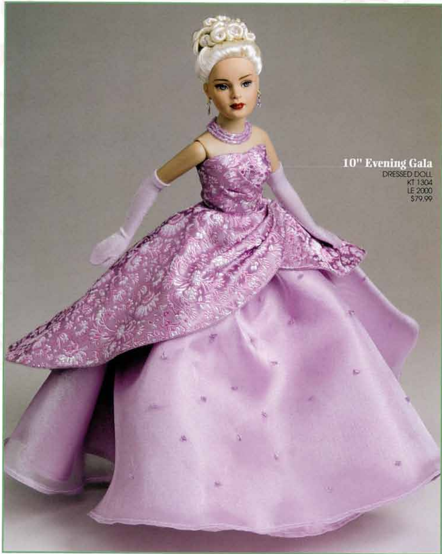
10" Evening Gala DRESSED DOLL KT 1304 LE 2000 $79.99