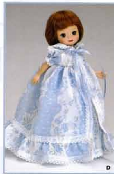
D. Blue Nightie OUTFIT ONLY BC 8304 LE 2000 $24.99