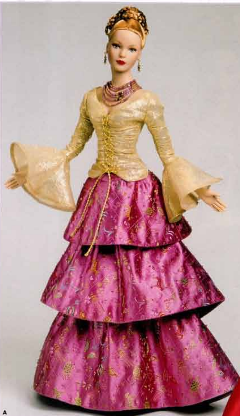
A. Rapture DRESSED DOLL TW 1303 LE 1500 $149.99 NOTE: DOLL AS SHOWN WILL SHIP WITH BENDING ARMS