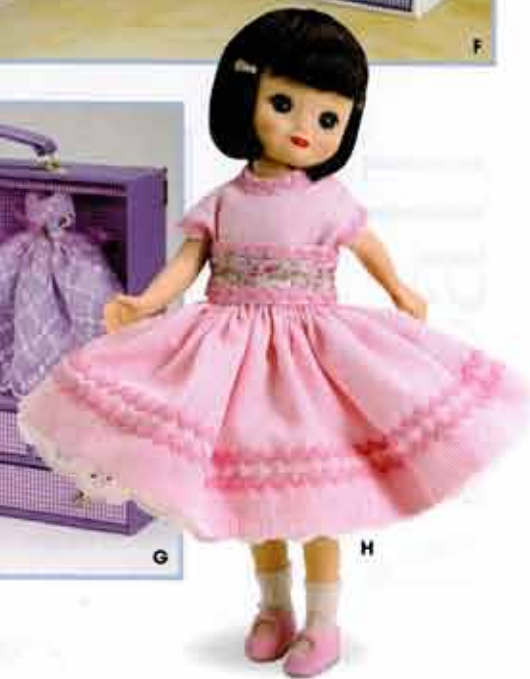
H. Rosebud OUTFIT ONLY BC 8303 LE 2000 $24.99