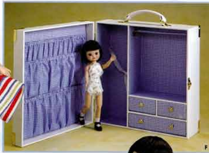
F. Wardrobe Trunk ACCESSORIES BCA 301 OPEN $34.99 NOTE: DOLL SOLD SEPARATELY