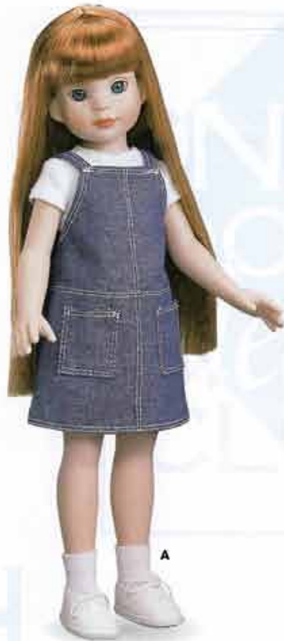
A. Jane CLUB DOLL RT 1101 OPEN $55.00