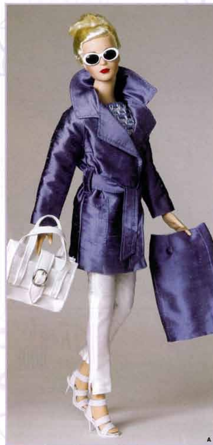
A. Jet Set Jaunt OUTFIT ONLY TW 8306 LE 1500 $59.99