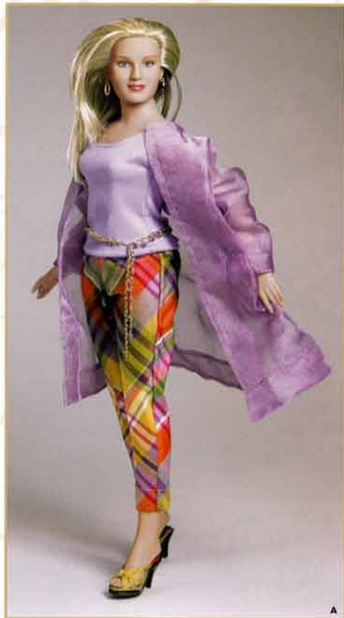
A. Enticing OUTFIT ONLY EM 8301 LE 1500 $44.99