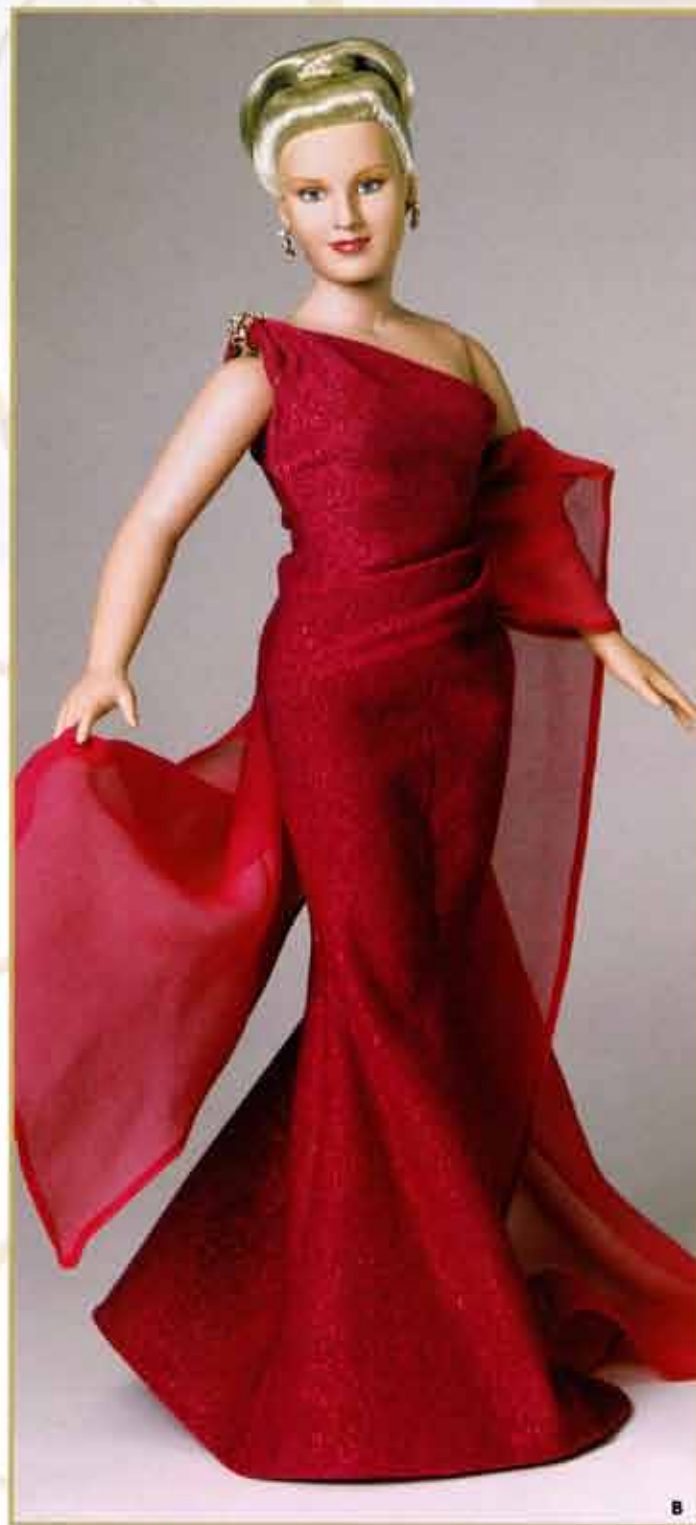
B. Eternal DRESSED DOLL EM 1301 LE 2000 $129.99

"...the hottest product launched...at the American International ToyFair..." New York Post, February 12, 2002