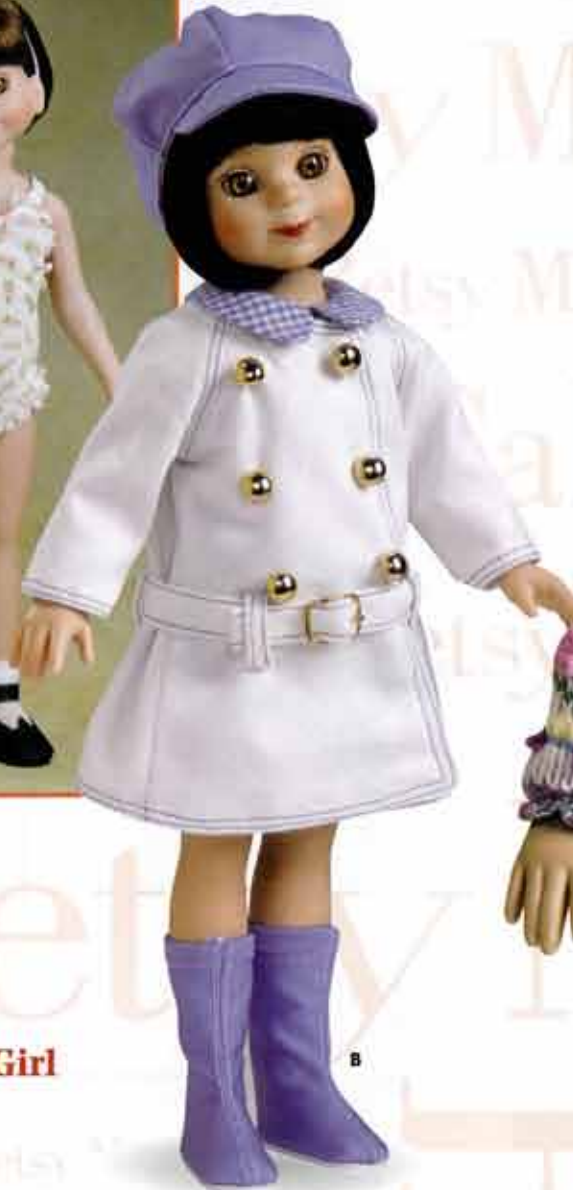
B. 14" Groovy Girl OUTFIT ONLY BM 8302 ANNUAL $29.99