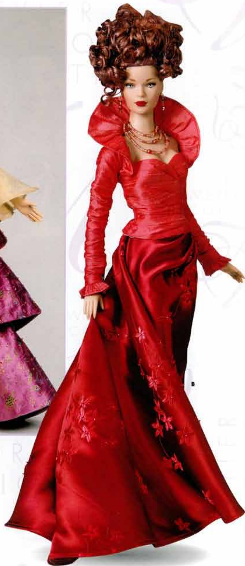
B. Cinnabar DRESSED DOLL TW 1304 LE 2000 $149.99 NOTE: DOLL AS SHOWN WILL SHIP WITH BENDING ARMS