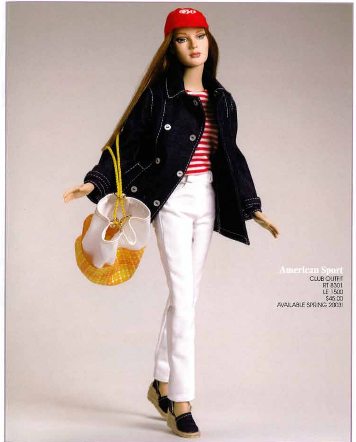
American Sport CLUB OUTFIT RT 8301 LE 1500 $45.00 AVAILABLE SPRING 2003!

GENERAL NOTE: PRICES SHOWN DO NOT INCLUDE SHIPPING