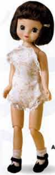
A. Betsy Basics-Brunette BASIC DOLL BC 0103 OPEN $39.99