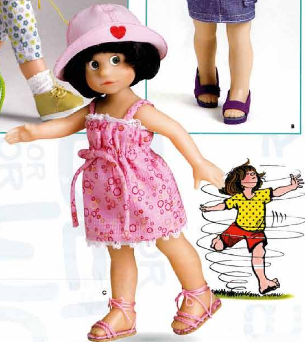
C. Pink Bubbles OUTFIT ONLY FW 8302 ANNUAL $19.99