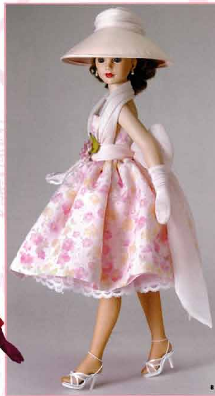
a. Date for Dinner OUTFIT ONLY KC 8303 LE 1000 $44.99