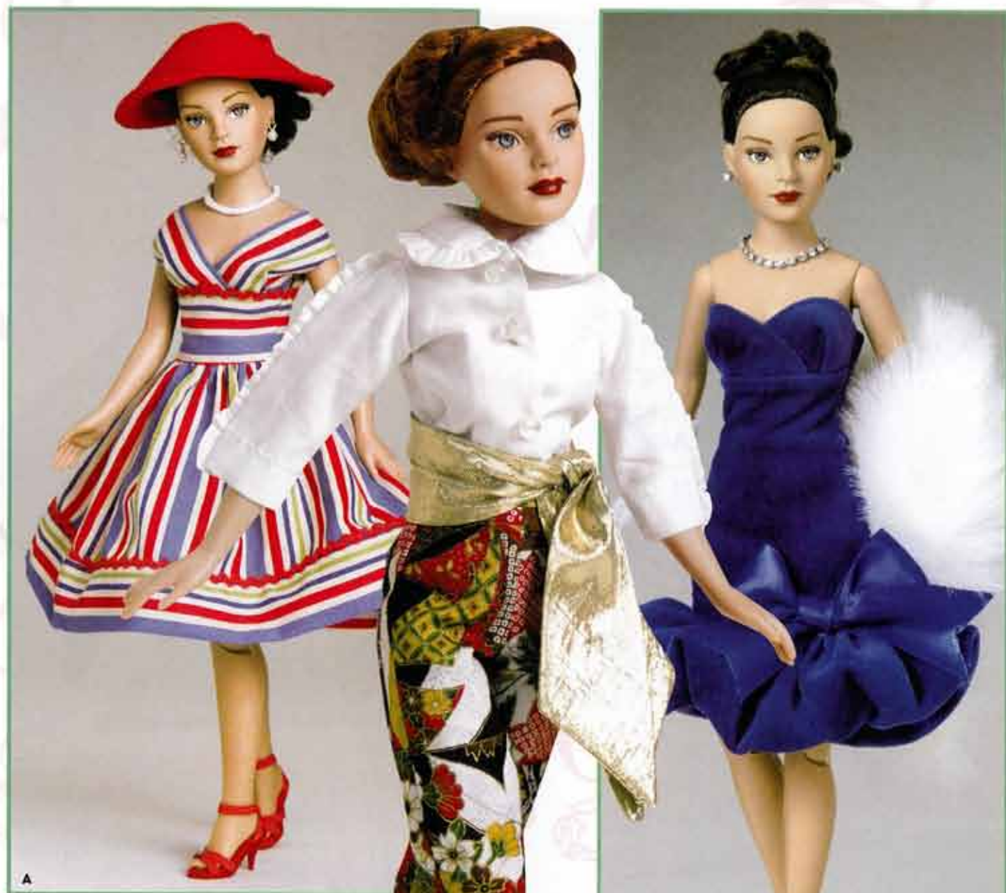
A. 10" Fiesta Kitty OUTFIT ONLY KT8306 LE 2000 $34.99