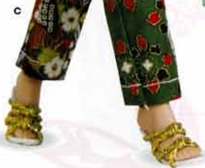
C. 10" Home for the Holidays OUTFIT ONLY KT 8303 LE 2000 $34.99