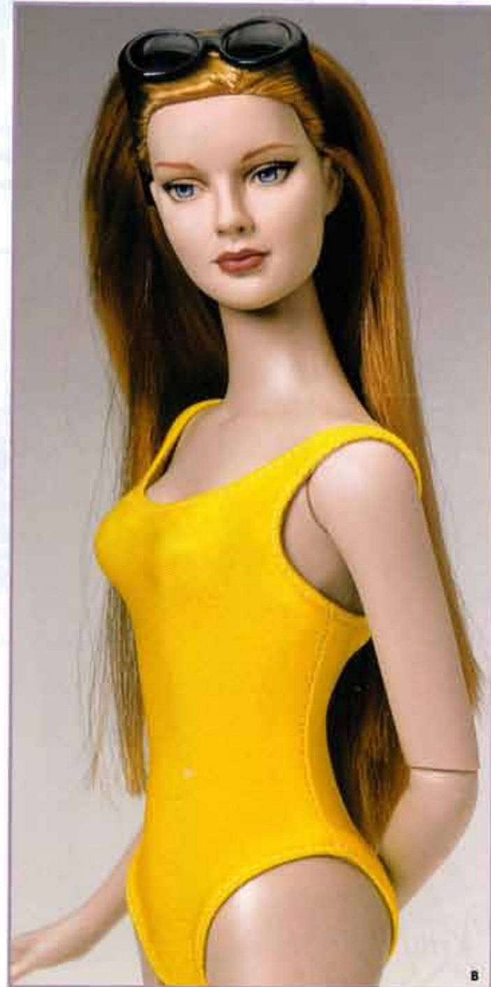
B. Fashion Jane CLUB DOLL RT 1301 OPEN $50.00 AVAILABLE SPRING 2003!

What??? You say you're not a subscriber? Well, it's time to join Jane and all her friends in the Tonner Doll Club! Don't miss this opportunity to join the exciting and exclusive Tonner Doll Collectors Club... No doll lover - or collector - should miss out on belonging to the Tonner Doll Club!