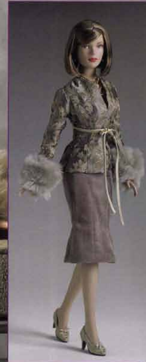
Business as Usual OUTFIT ONLY TS-TWOF-03 LE 1500