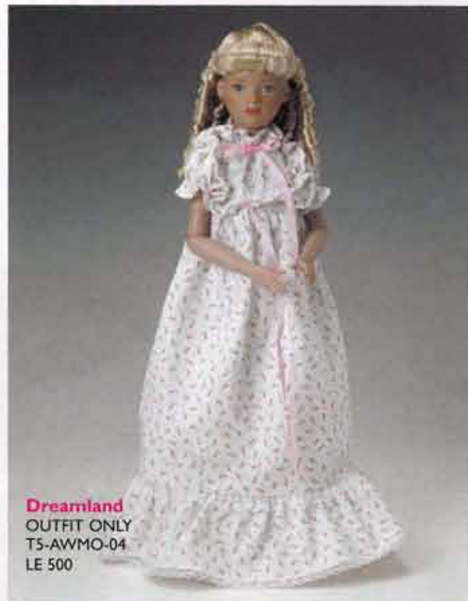
Dreamland OUTFIT ONLY T5-AWMO-04 LE 500