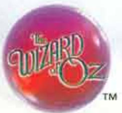
B. Crimson Castle Holidays DRESSED DOLL T5-OZDD-01 LE 1500