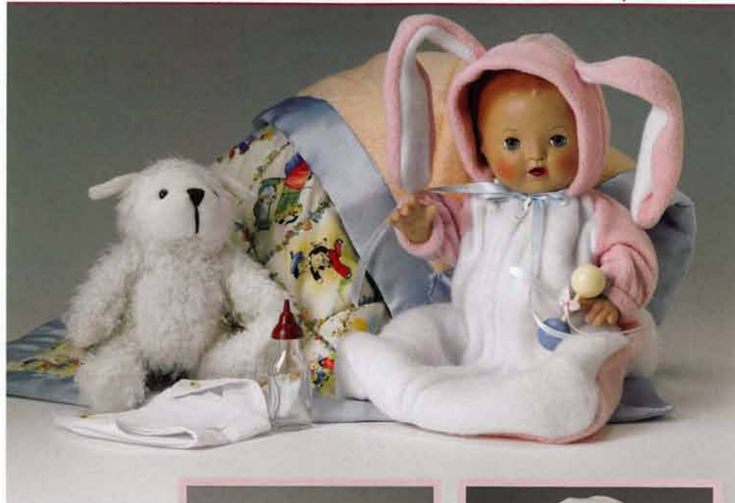
Bunnies & Bears Layette GIFT SET E5-DDDD-01 LE 500 Includes Blanket, Three Outfits and Accessories as shown.