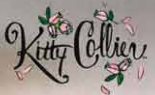
Sunshine & Daisies DRESSED DOLL T5-KCDD-01 LE 750