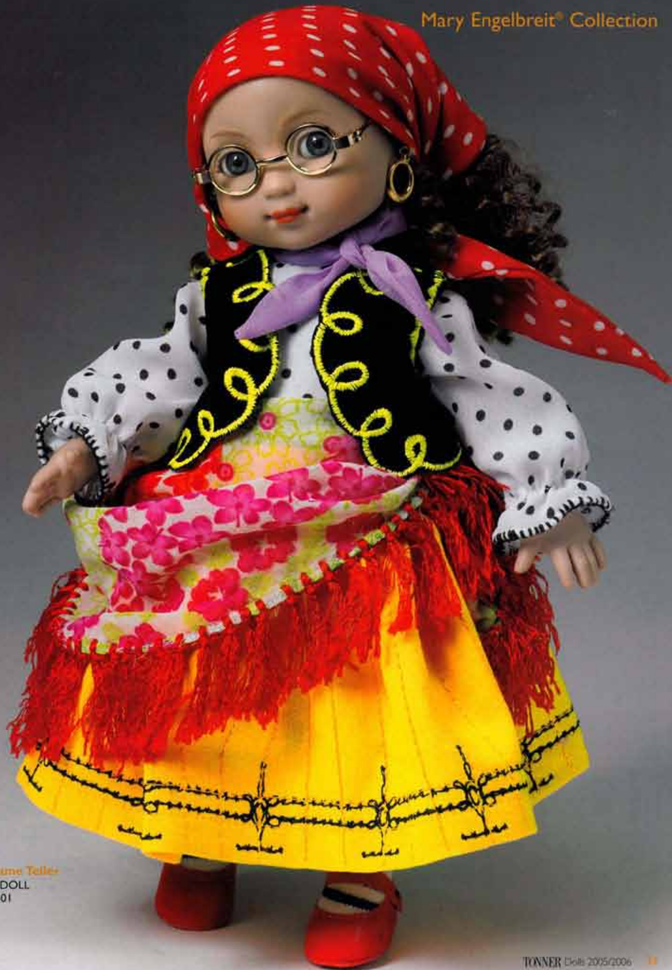
10" Fortune Teller DRESSED DOLL T5-AEDD-01 LE 500