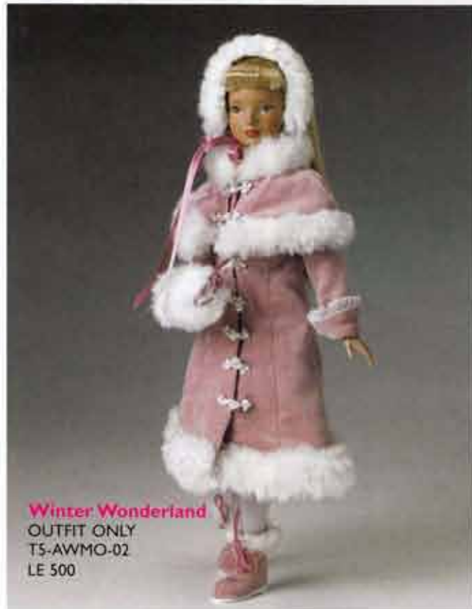
Winter Wonderland OUTFIT ONLY T5-AWMO-02 LE 500