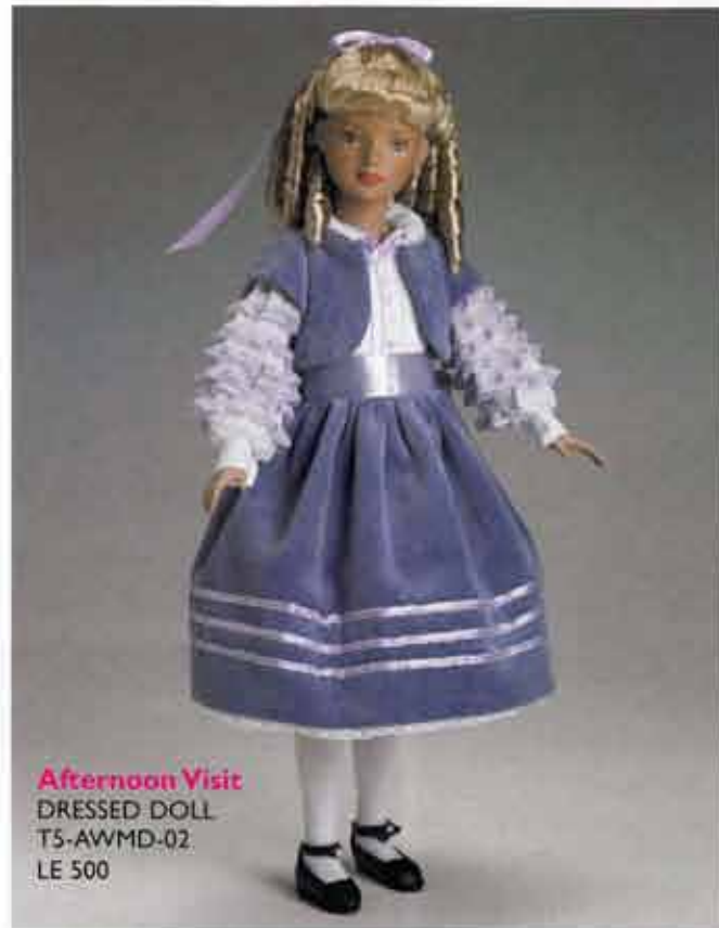
Afternoon Visit DRESSED DOLL T5-AWMD-02 LE 500