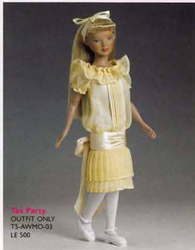
Tea Party OUTFIT ONLY T5-AWMO-03 LE 500