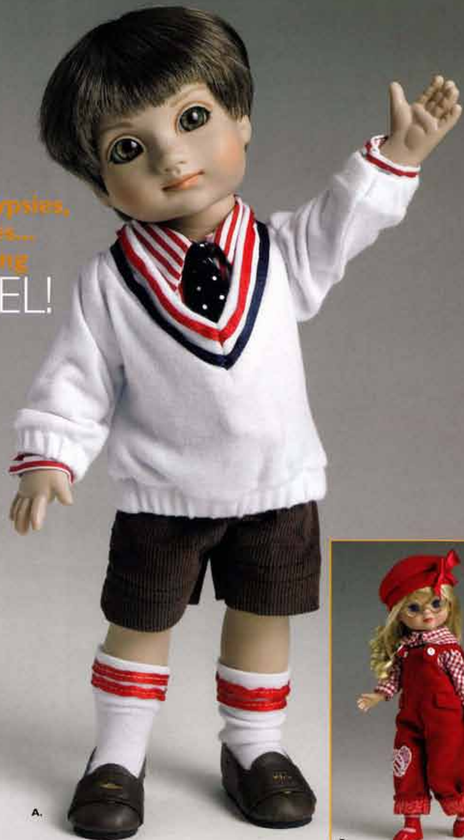
A. 14" Michael DRESSED DOLL T5-AEDD-02 LE 500