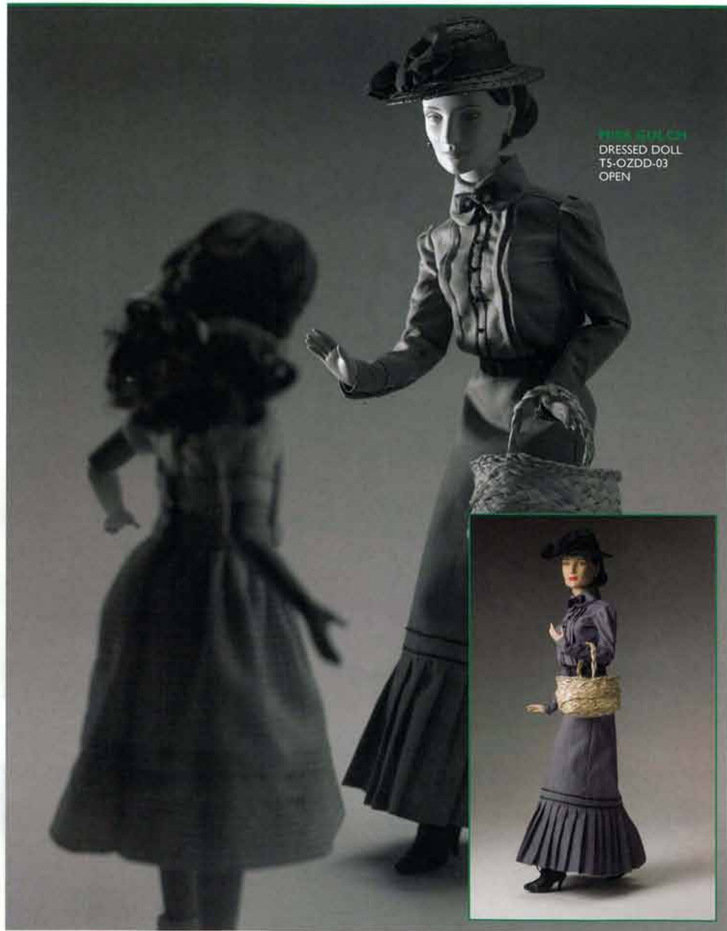
WITH SEWING DRESSED DOLL T5-OZDD-03 OPEN