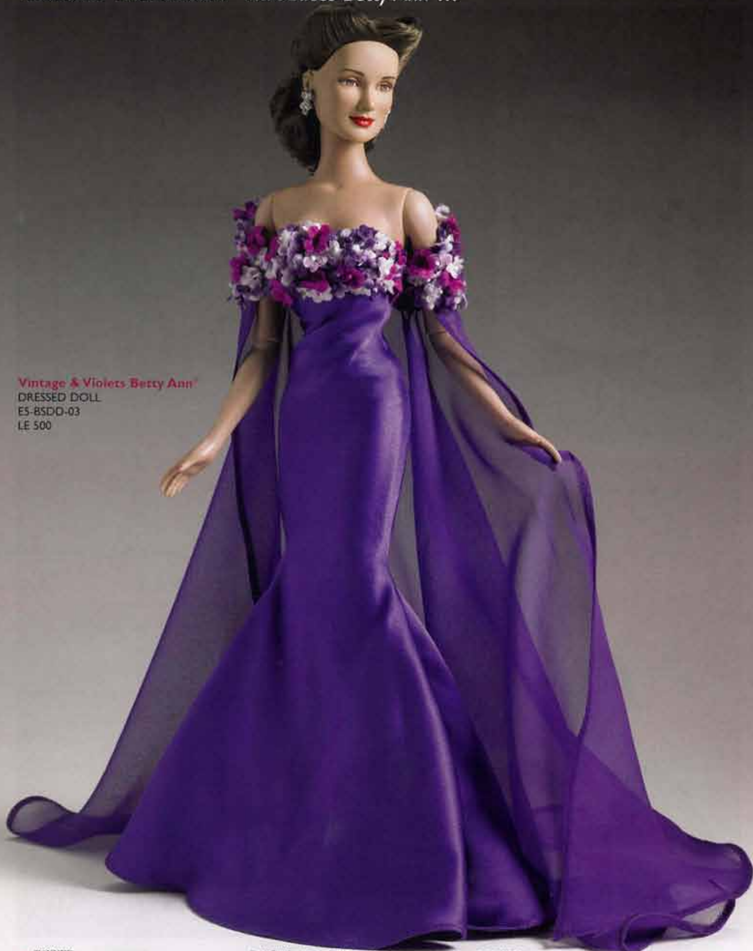
Vintage & Violets Betty Ann® DRESSED DOLL E5-BSDD-03 LE 500